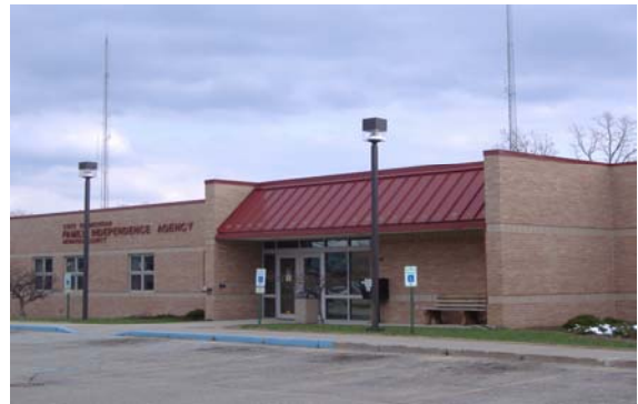
The DHS Building is located at 1018 Newell Street and has a maroon roof. Parking is available from the entrance off North Street.

Regular sessions of the Board are held the second and the fourth Wednesday of each month at 9:30 a.m. in the Board of Commissioners Room located in the Administration Building.